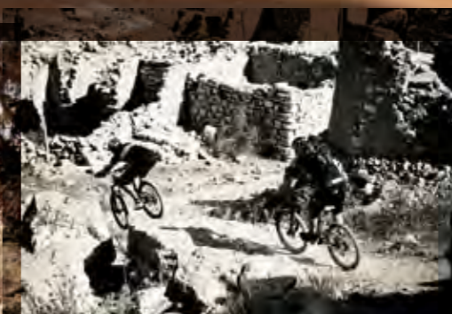
Above: Wadi Dana: 4,000 years of history and a 14km downhill — both proved too much to resist