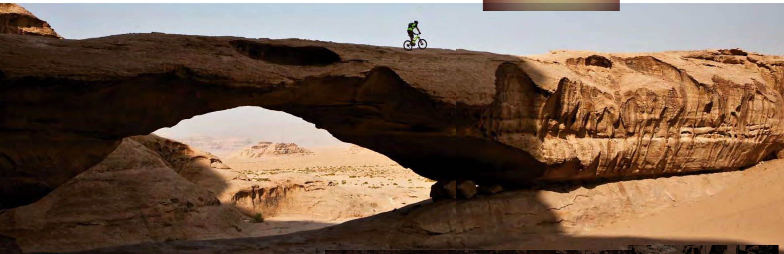
BELOW: Hans, solo: Wadi Rum's rock bridges turn out to be rideable after all